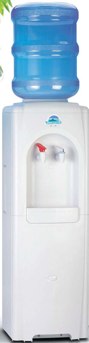
B10CH Hot & Cold (pictured) B10C Cool and Cold (also available)